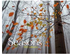
Seasons Size 10.75 in x 16.5 in (open)