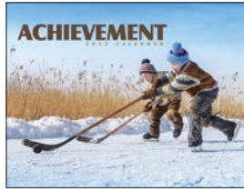
Achievement Size 10.75 in x 16.5 in (open)