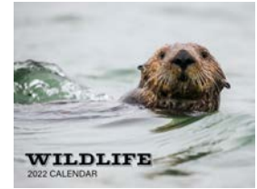
Wildlife Size 10.75 in x 16.5 in (open)