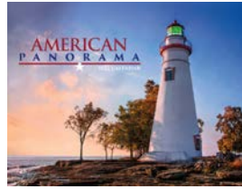
American Panorama Size 10.75 in x 16.5 in (open)