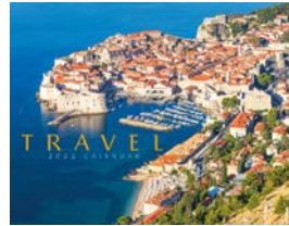
Travel Size 10.75 in x 16.5 in (open)