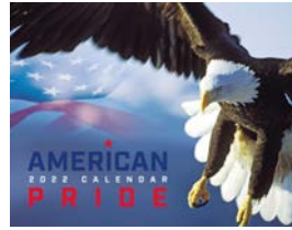
American Pride Size 10.75 in x 16.5 in (open)