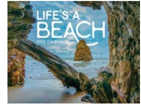
Life's a Beach Size 10.75 in x 16.5 in (open)